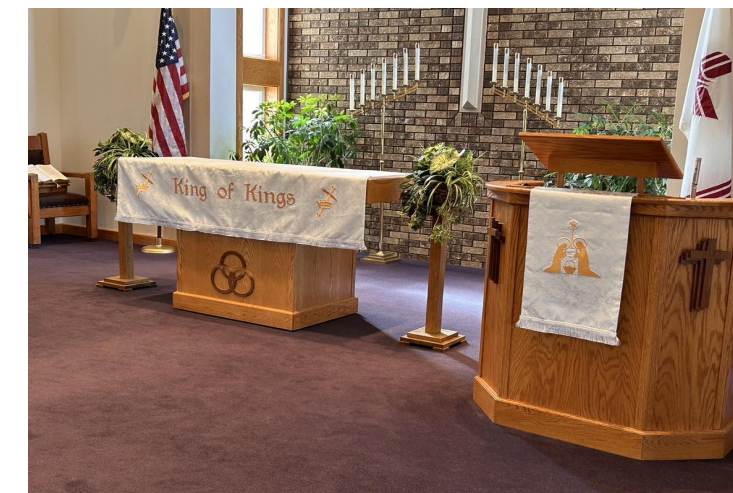
Paraments for Christmas season