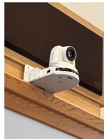
Swivel Optical Zoom Camera

We have also installed new security cameras on the exterior of the church building to keep a watchful eye in all directions around our property. We are grateful to the Lord for His ongoing providing for our physical and spiritual needs as we celebrate and proclaim Christ crucified and risen for our sins.