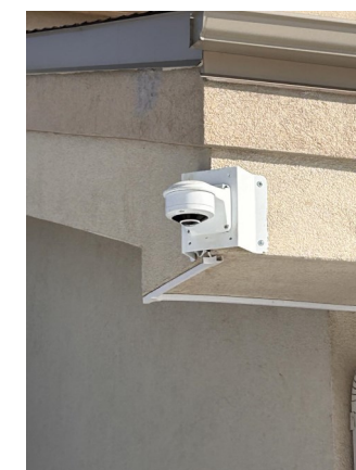
Exterior Security Camera