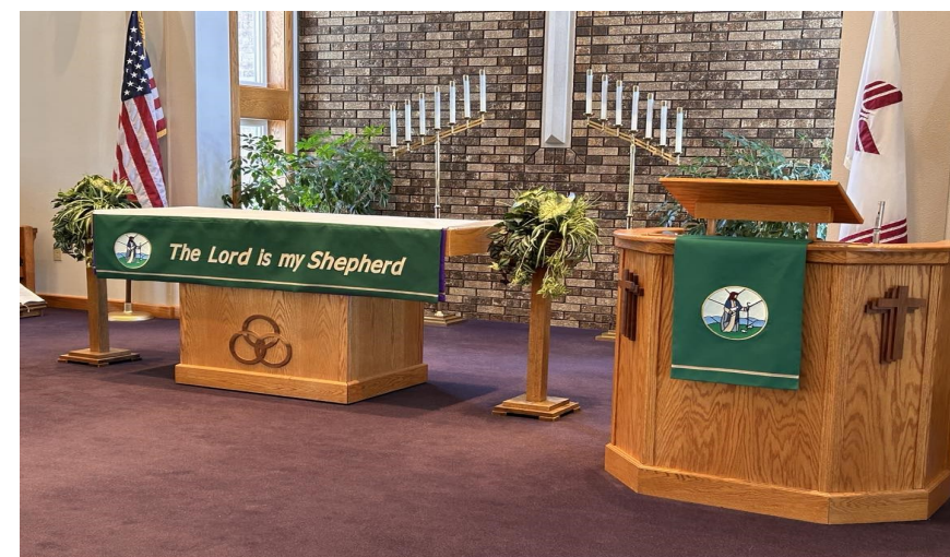
Green Paraments for Non-festival half of the church year.